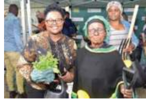
A successful operation Mbo held in Kokstad. Community members came in their large numbers to listen to different the programmes from Departments.