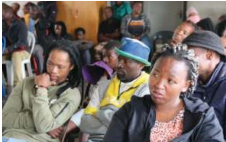
Jubilation was the order of the day when the Harry Gwala District Municipality announced three projects in the pipeline, expected to commence soon in UMzimkhulu. The community members came in their large numbers to listen to the Mayor's address regarding the planned infrastructural projects.