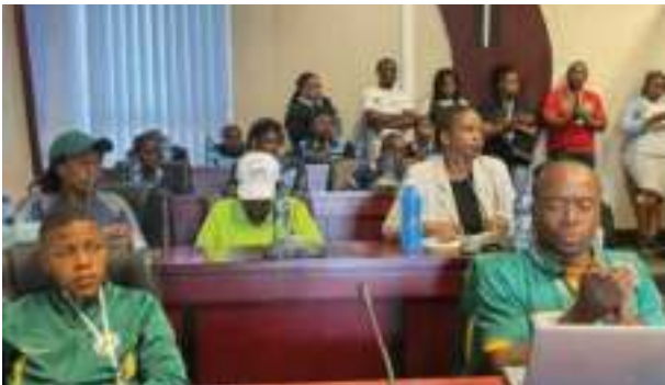
Harry Gwala District Municipality was ecstatic to host the Boxing Week municipal programme.