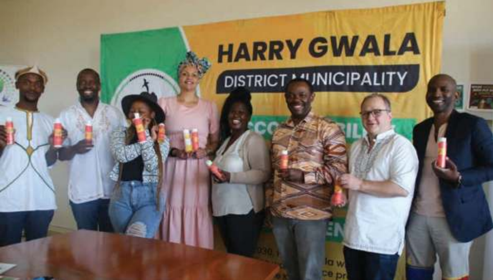
The Harry Gwala Development Agency (HGDA) hosted the Product Handover and Project Launch of Lemvelo body lotion and body massage oil.