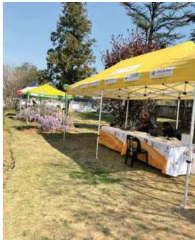
The commemoration of International FAS Day was held in the Kokstad Town Hall by the Deputy Minister of the Department of Social Development, Mme Hendrietta Bogopane-Zulu. Community members, pregnant mothers and community leaders from various local municipalities were in attendance.