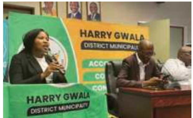
especially at a younger age so they can grow in the sport. I started boxing when I was just 12 years and it has been amazing journey," she said.