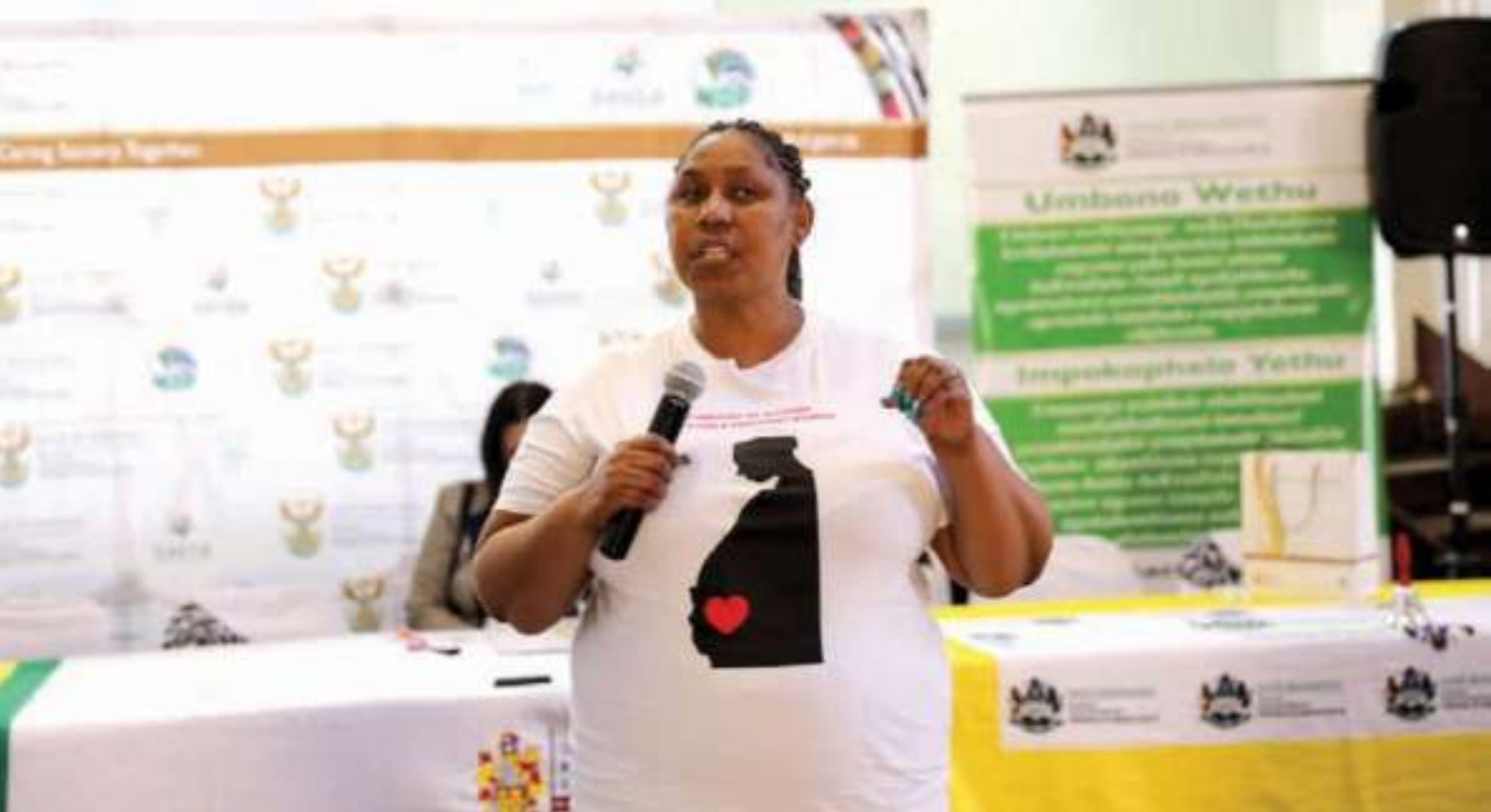
The Deputy Minister of the Department of Social Development - Mme Hendrietta Bogopane-Zulu's address on the closing of the 9-9-9 Campaign held in Kokstad. The Deputy Minister pleaded with pregnant mothers not to drink while expecting their bundles of joy.