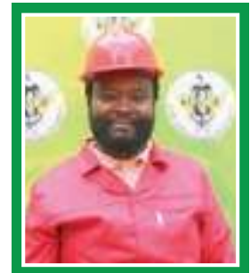
LUNGU LE-EXCO UKHANSELA uZ. TSHANGASE