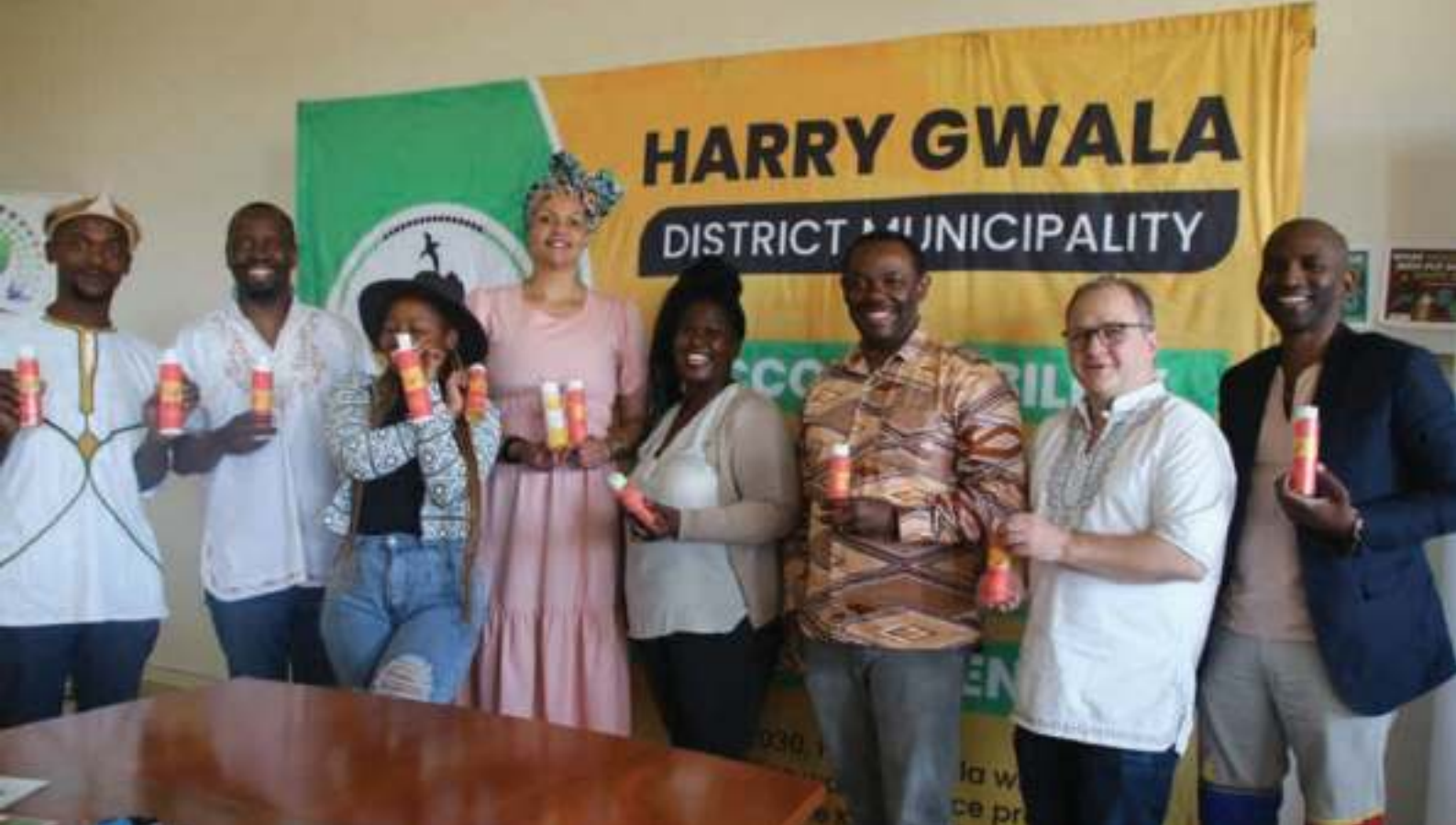
IHarry Gwala Development Agency (HGDA) isingathe Ukwedluliswa Komkhiqizo Nokwethulwa KwePhrojekthi kweLemvelo Body Lotion kanye Body and Massage Oil.