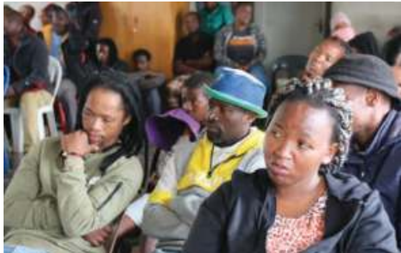
Bebemamatheka, bejabule ngesikhathi uMasipala Wesifunda iHarry Gwala umemezela ukuthi kuzoba namaphrojekthi amathathu azoqala khona maduze nje eMzimkhulu. Amalungu omphakathi abeze ngobuningi bawo ukuzolalela inkulumbo kaMeya.