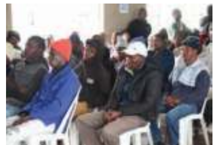
Amalungu omphakathi anikezwe ithuba lokubuzwa imibuzo nokuthola ukucaciseleka ngalawa maphrojekthi.