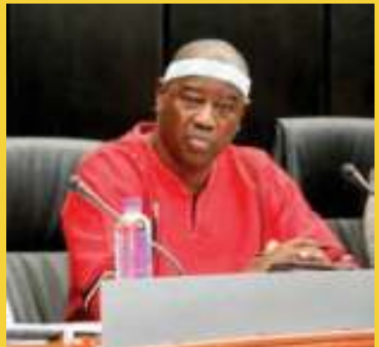
Umhlangano weDistrict Development Model (DDM), obusezindlini zamakhansela kuMasipala uMzimkhulu, ube yimpumelelo enkulu futhi uthanyelwe ngokwanelisayo ngamalungu.

U MASIPALA Wesifunda iHarry Gwala, ubambe umhlangano wesizinda sezepolitiki weDistrict Development Model (DDM), ezindlini zoMkhandlu eMzimkhulu.