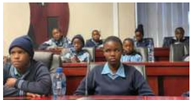
Uhlelo lwesibhakela luhambele uMasipala Wesifunda iHarry Gwala lwaba yimpumelelo. Amantombazane avela ezikoleni nasezikhungweni zesibhakela ezehlukile abe khona.