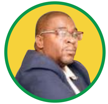
UMnu uNdabezitha Tenza Umphathi Wezokuxhumana

N GIBINGELELA zonke izakhamuzi zakuMasipala Wesifunda iHarry Gwala. Sihlangana kule nkundla lapho sinibikela khona ngenqubekela phambili eseyenziwe kuze kube manje nguMasipala mayelana nokulethwa kwezinsizakalo. Igunya siliithola kuso iSigaba 152(1) soMthethosisekelo weRepublic of South Africa, elihlinzeka uMasipala Wendawo ukuthi-