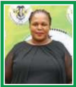
MHLONISHWA SOTSWEBU OMKHULU UKHANSELA uN MHATU