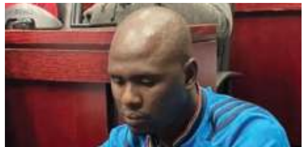
UMasipala Wesifunda iHarry Gwala ujabule kakhulu ngokuba nohlelo lokuhambela oMasipala abesibhakela.