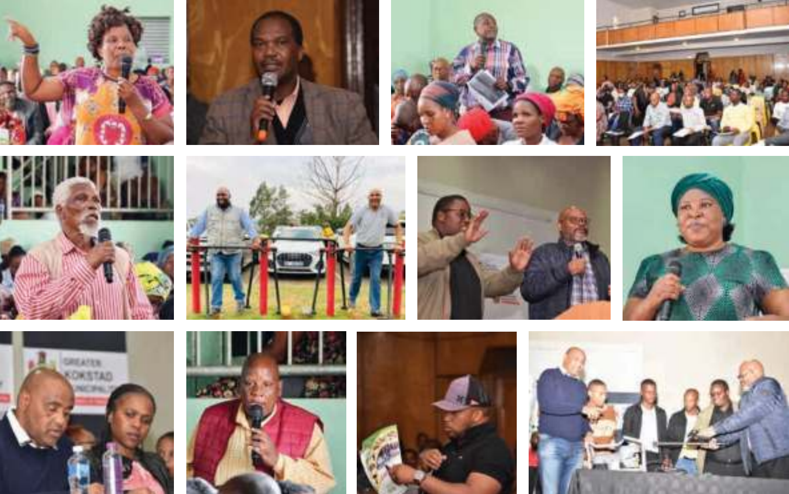
UMasipala Wesifunda iHarry Gwala ube nemibukiso yoHlelo Lwentuthuko Oludidiyelwe (IDP) lonyakamali wezi-2022/2023. Amalungu omphakathi abe nethuba lokubuza izikhulu nabaholi bezepolitiki imibuzo mayelana nokuhlinzeka izinsizakalo.