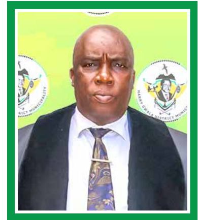
OHLONIPHEKILEYO USOMLOMO UCEBA M.S.D MDUNGE