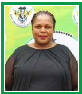
OHLONIPHEKILEYO UMBHEXESHI OMKHULU UCEBA N MHATU