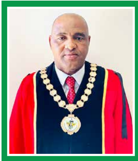
OHLONIPHEKILEYO USODOLOPHU UCEBA Z.D NXUMALO