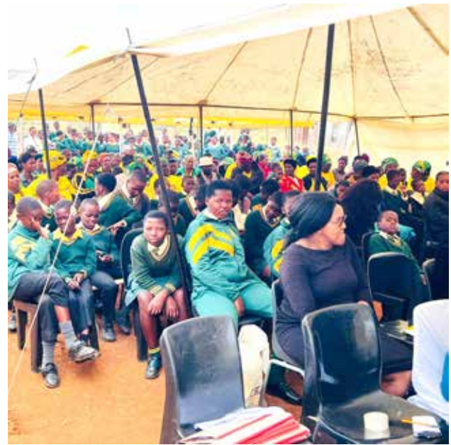
Njengexalenye yenkqubo iBack-To-School, u-SASSA kunye noMasipala wesiThili iHarry Gwala banikezele ngee-uniform kubafundi base-Ezimpangeni.

B EKULUNCUMO lodwa ngethuba abantwana abangama54 base-Ezimpangeni befumana ii-uniform zabo ezintsha kraca.