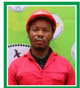
UCEBA X. MEMELA