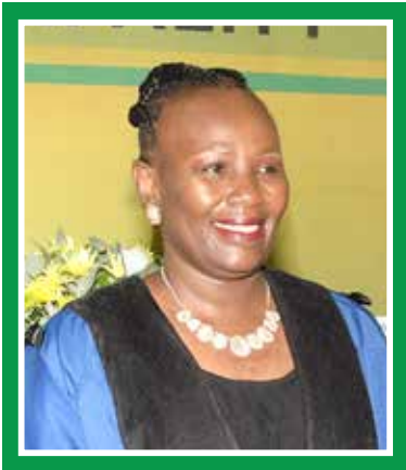
OHLONIPHEKILEYO ISEKELA-SODOLOPHU UCEBA T.N JOJOZI