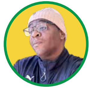
UMnu uNdabezitha Tenza Umphathi Wezokuxhumana

N DIVUMELENI ndibhotise ngentobeko kuni bafundi bethu abethembekileyo. Xa siphetha unyaka mali wama2023/2024, ndithanda ukwenza umbulelo ongazenzisiyo ngenkxaso yenu engagungqiyo. Inkxaso yenu iyasikhuthaza kwaye isinika umdla wokufezekisa izidingo zenu. Okwethu kulula; ukunika ingxelo kuluntu nakubahlawuli beenkonzo zikamasipala. Ushicilelo lwethu luphuma rhoqo ngekota, ngeenjongo zokunika ingxelo ngenkqubo yokuhanjiswa kweenkonzo kunye neminye imicimbi yokusebenza kukamasipala esiziqhenya ngayo. Yindlela esulungekileyo esinika ngayo ingxelo eyenza ushicilelo lwethu lunqenqenze phambili. Zilungiseleleni ukufumana ingxelo epheleleyo ephuma kumasebe ethu. Kwiiveki ezimbalwa ezigqithileyo (29 EyeCanzibe 2024), ilizwe loMzantsi Afrika liqhube ukhetho lwelizwe olunzima ngenxa yemeko yezopolitiko. Abantu bavakalise amazwi abo ngokuzibandakanya kolu khetho beveza uluvo lwabo. Xa siqala uhambo olutsha ngaphantsi kolawulo lwesixhenxe, siqinisekile ukuba kuzakuba khona utshintsho kwimiba yokuhanjiswa kweenkonzo. Inani labantu ababhalisele ukhetho abazizigidi ezingama27.6 lubonakalisa impumelelo yethu singu rhulumente ngokubaluleka kokuzibandakanya. Kudala silwela uluntu olumanyeneyo kweli lizwe. Olu luntu luzibandakanya kuzo zonke iinkqubo zikarhulumente, kuquka ukuvota kukhetho.