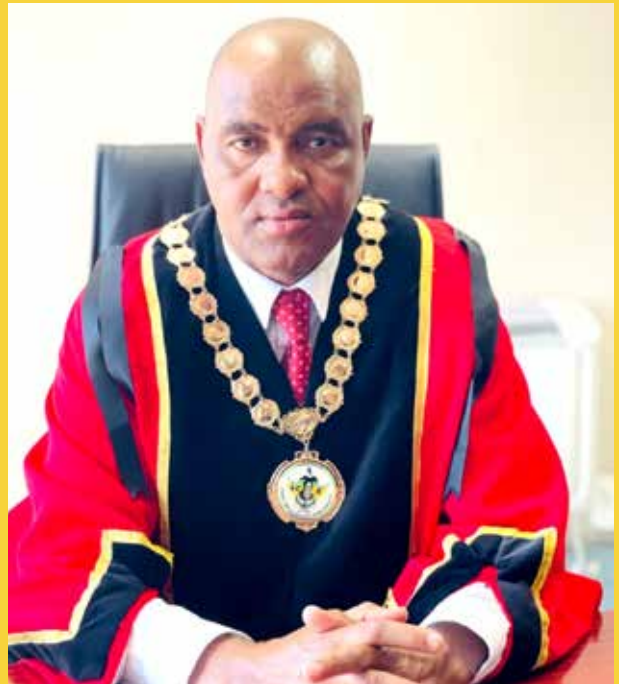
USodolophu waseHarry Gwala uCeba uZ.D Nxumalo

Ngelixa ndisithi thaca uhlahlo mali ukuze luvunywe, ndithe, indlela esingisa kuhlahlo lwabiwo