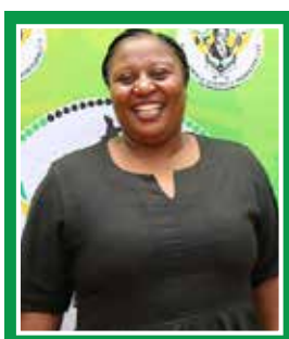
UCEBA N. MDA