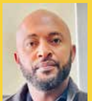
UMNU ULINDUMUSA GWALA Mlawuli: linkonzo Zamanzi