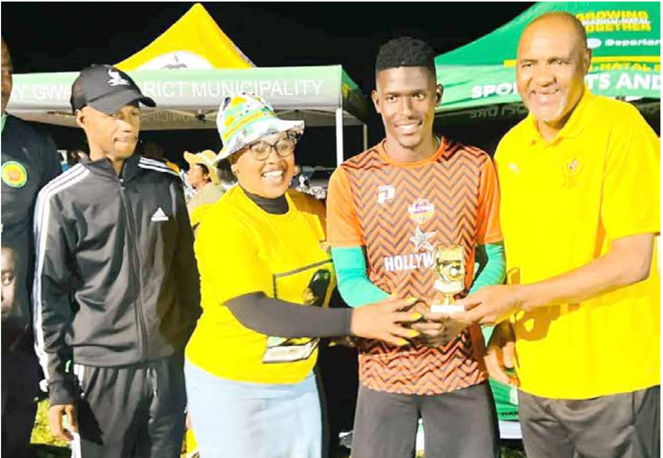
Apha kungethuba kunikezelwa ngeziphopho kwiHarry Gwala District Mayoral Cup 2024.

K ULANDELA ukhuphiswawo lwezemidlalo kwisigaba sasekuhlaleni, uMasipala wesiThili iHarry Gwala usingathe itumente yekomityi kasodolophu yesiThili kumabala ezemidlalo iJeffrey Zungu Sports ebutsheni benyanga yeCanzibe. Le midlalo iqale ngokhuphiswano kwisigaba seewadi, abaphumelelo badlala kwisigaba soomasipala basekuhlaleni, ngaphambi kokuba bagqithele kwisigaba sesiThili. Abaphume indawo yokuqala neyesibini kwimidlalo yekomityi kasodolophu ekuhlaleni, ngabo abathabathe inxaxheba kwimidlalo yekomityi kasodolophu yesiThili.