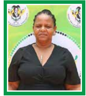
UCEBA P.N. DAMOYI