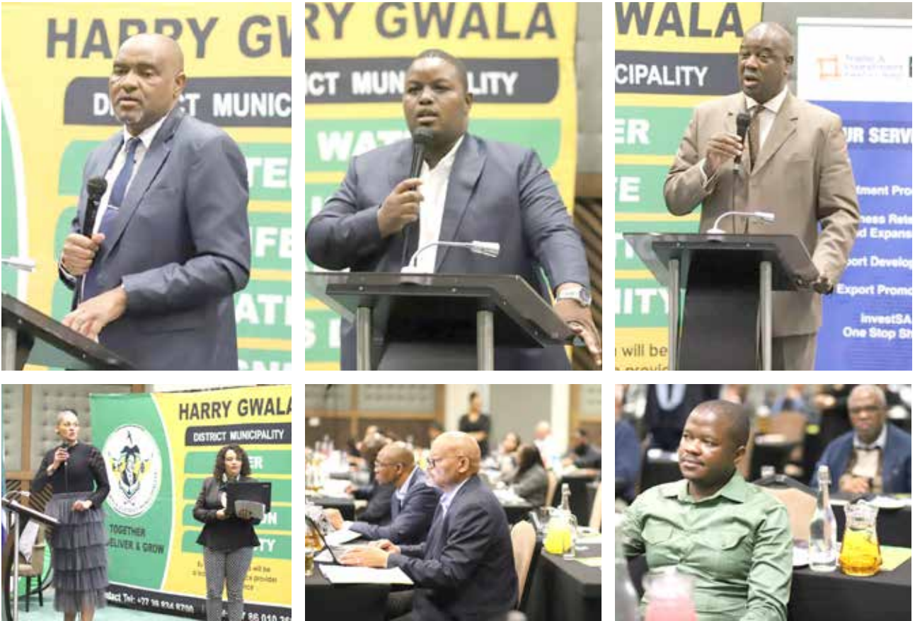
I Harry Gwala Investment Summit yesibini ebanjelwe eSani Pass (Underberg), ngeenjongo zokugcina nokutsala utyalo mali.

USodolophu wenze intetho kwiNgqungquthela yesi-2 yoTyalo-mali eHarry Gwala: