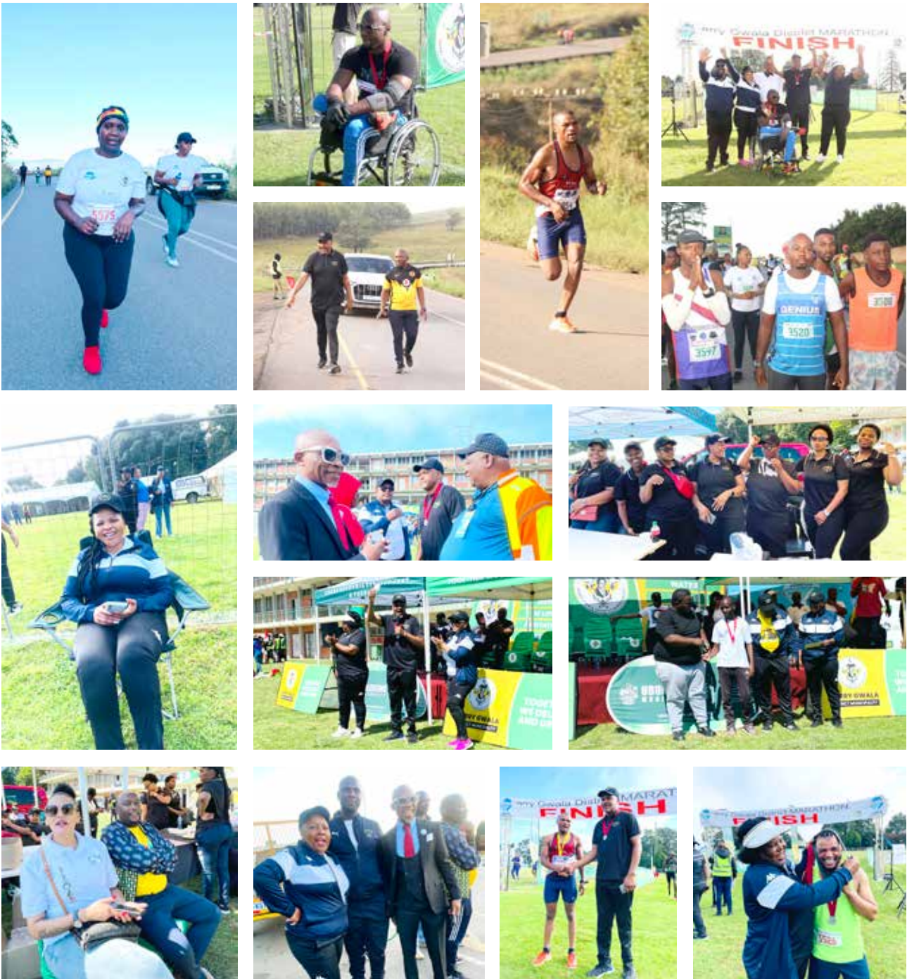
Ngaphambili, ngethuba, nasemva kokunikezelwa kweembasa kwi2024 Harry Gwala Marathon.