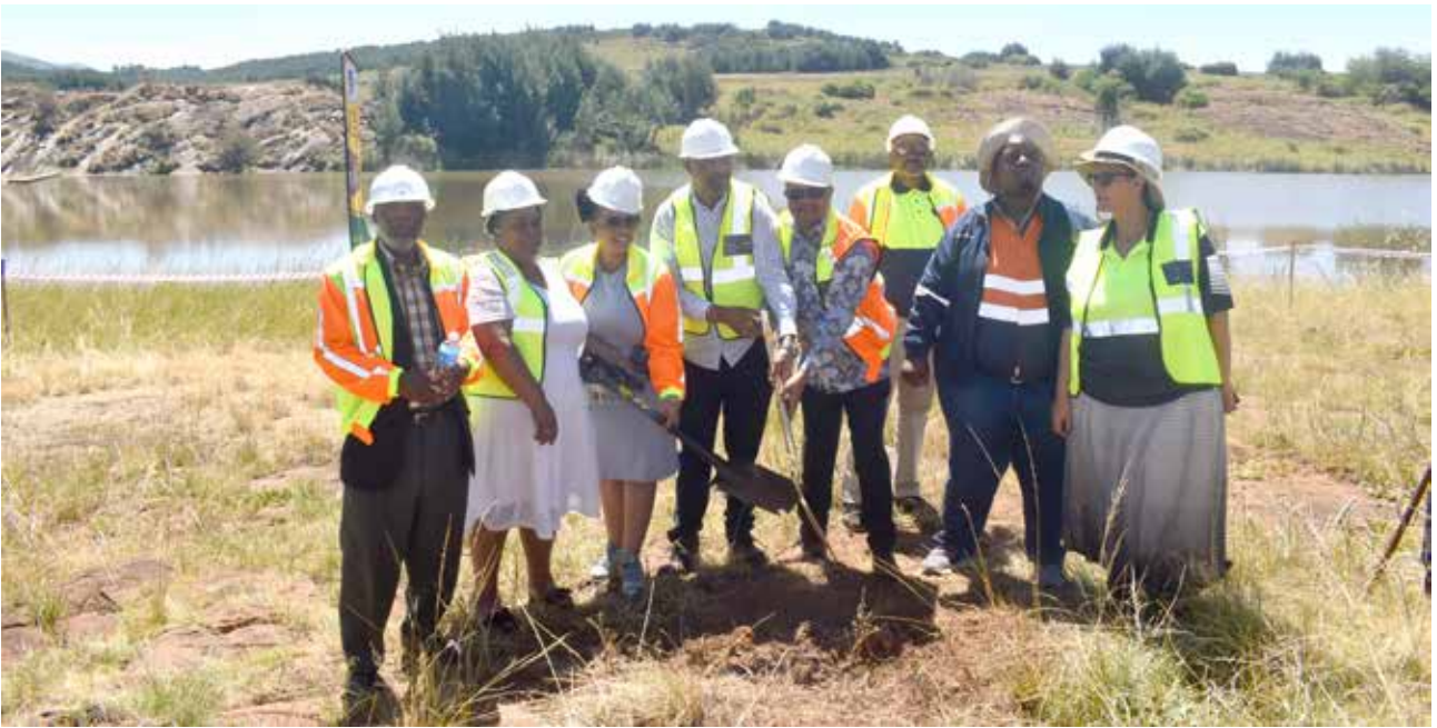
Kuphethulwa isoyi lokwenyuswa kodonga eKempsdale Dam.