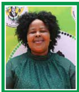
UCEBA T.S.H. GAMEDE