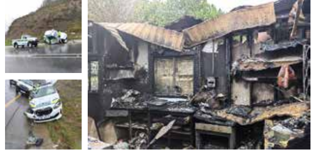
Umfanekiso 4: Ingozi yezithuthi eyenzeke kumgwaqo uN2 kwindawo iNgqumarheni kunye nendlu etshabaleleyo eSingisi eKokstad

iyatyibilika ngenxa yemvula esele iqalile kumasipala iGreater Kokstad.