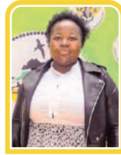
UCEBA N.H. ZACA