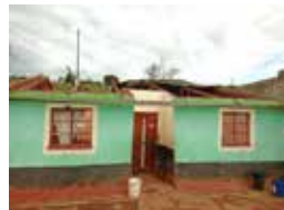
Umfanekiso 1 & 2: Izehlakalo zemibane nomoya omandla ezenzeke kumasipala wasekuhlaleni iDr. Nkosazana Dlamini-Zuma