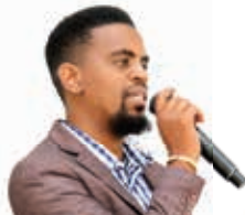
UMNU ULINDOKUHLE CHILIZA USEKELA MLAWULI: UMCWANGCISI KWEZONXIBELELWANO KWISITHILI (GCS)