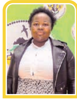
UCEBA N.H. ZACA