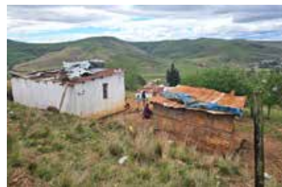
Umfanekiso 5: Amakhaya achaphazelekileyo ngumoya omandla eMzimkhulu kwaWard 12

Kwinyanga YeDwarha 2024, kumasipala wasekuhlaleni uMzimkhulu kuye kwakhona ukutsha kwesakhiwo, iimvula ezimandla kunye nomoya omandla kwiindawo ezohlukene. Ngamakhaya alishumi (10) achaphazelekileyo, amakhaya amathathu (03) afumana umonzakalo, amakhaya amathathu (03) atshabalala, bane (04) abantu abadinga iindawo zokufihla iintloko, kwaye bangamashumi amahlanu anesixhenxe (57) abantu abachaphazelekayo zezi zehlakalo. Azibangakho iingxelo zomntu oswelekile okanye olimeleyo.