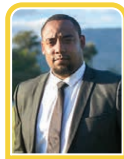
UCEBA B.L. MARNCE