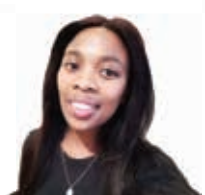
UNKS UXOLISWA DLAMIN ISEKELA KWEZOKUXHUMANANA KWA-EPWP