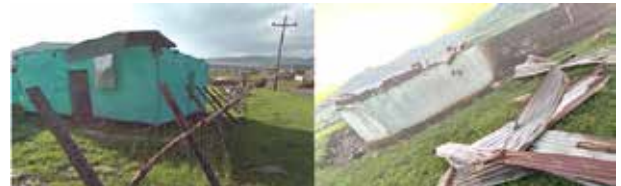
Umfanekiso 1 & 2: Umonakalo owenziwe ngumoya omandla kumasipala wasekuhlaleni iDr. Nkosaza Dlamini-Zuma