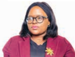
UNKS UATH'ENKOSI BAQWA ISEKELA KWEZOKUXHUMANANA