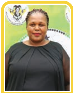
OHLONIPHEKILEYO UMBHEXESI OMKHULU UCEBA N MTHATU