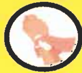
Wash your wrists