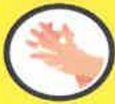
Scrub between your fingers