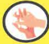
Rub hands palm-to-palm