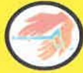
Rinse your hands