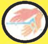
Wet your hands