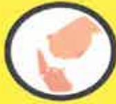
Clean under your fingernails